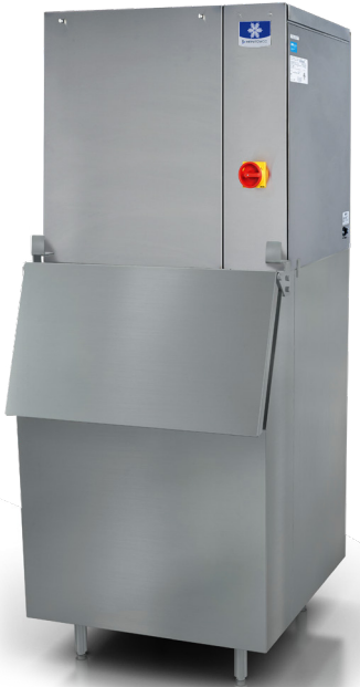
IDT0906W-261V As shown with SeaKing bin (recommended) (Ice Machine and Bin sold separately)