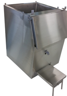
SeaKing bin (recommended)