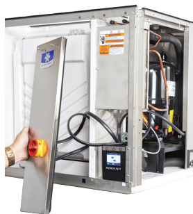
Easy access control panel